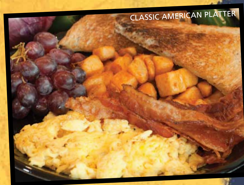
CLASSIC AMERICAN PLATTER