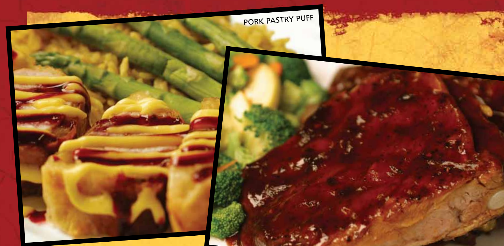
PORK PASTRY PUFF

Brisket marinated in Carolina BBQ sauce, served on a grilled brioche roll and topped with onion straws. 9.99